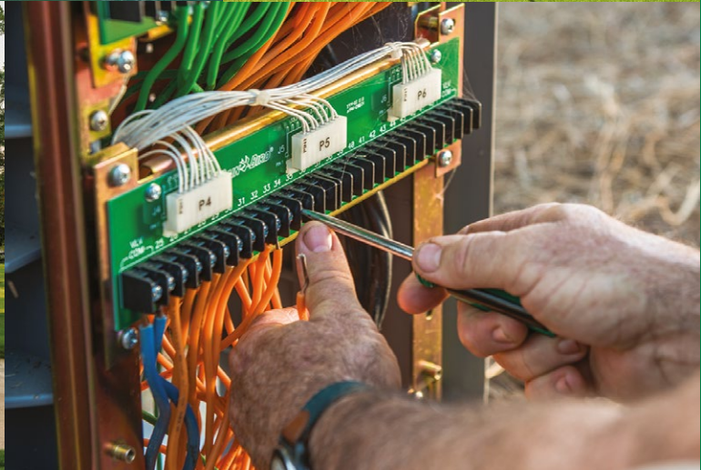
Cover: Atlanta Athletic Club – Johns Creek, Georgia