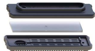
XFA Pressure Compensating, Anti-Siphon Emitter