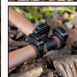
13mm Tee Fitting with ratchet clamps