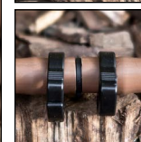
13mm Straight Fitting with ratchet clamps