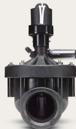
GSV200 / GSV201