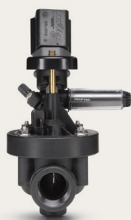
GSV100 / GSV101

Each model in the GSV Series is designed for long-lasting performance, easy maintenance and are available with NPT or BSP threads.