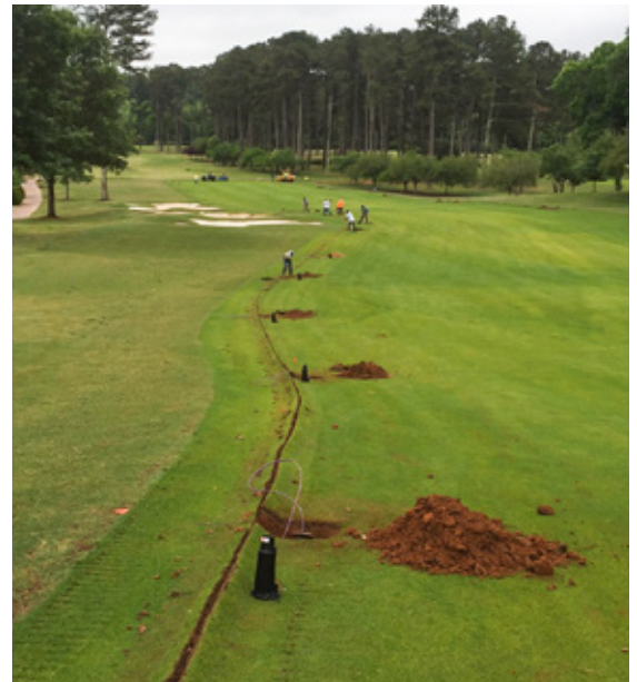
The irrigation system was updated in 2016, giving the club greater control and saving water and resources

valve from the pipeline. The existing satellite controllers were also now obsolete with the new system, so they were removed from the course.