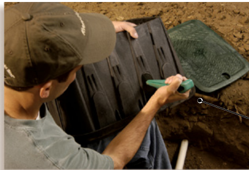
EASILY REMOVABLE KNOCK-OUTS SPEED UP INSTALLATION