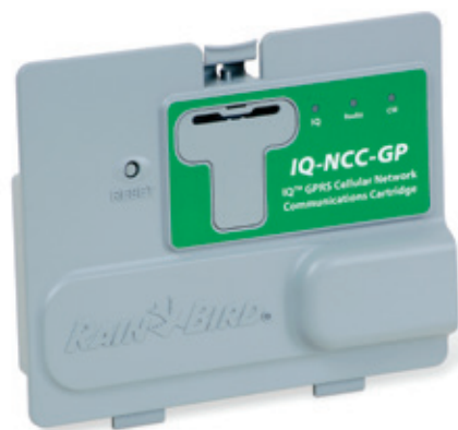
IQ NCC Network Communication Cartridge