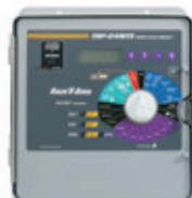
ESP-SAT Satellite Controller