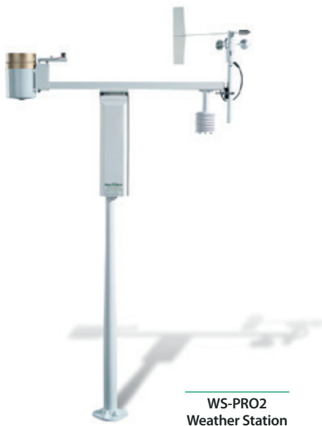
WS-PRO2 Weather Station