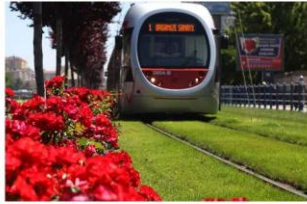
KAYSERAY HAFIF RAYLI SİSTEM 17KM REFÜJ ALANI SATALLITE SULAMA SİSTEMİ UYGULAMASI 2008-2009