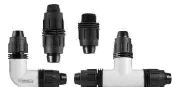
Twist Lock Fittings - 1000 Series (For use on 1" QF Header)