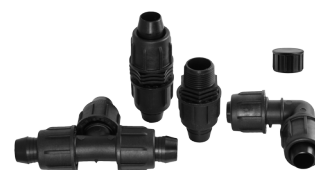
Twist Lock Fittings - 800 Series (For use on 3/4" QF Header)