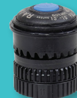
R1318F (4.0m to 5.5m)