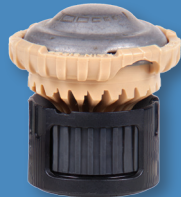
R-VAN18 (4.0m to 5.5m)