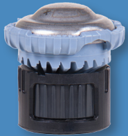
R-VAN14 (2.4m to 4.3m)