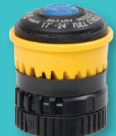
R1724F (5.2m to 7.3m)