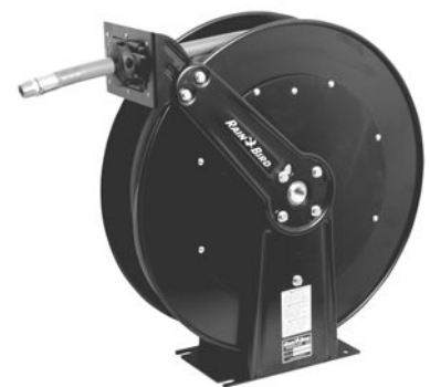
Rain Bird Spring Driven Reel

Poly Hose Reel —Lightweight and easy to handle, meets the needs for continuous, problem-free operation. Highly resistant to acids and alkalis.