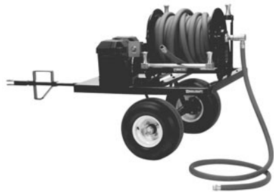
Towable Hose Reel Trailer

Towable Hose Reel Trailer —Ergonomic design and rugged construction makes hose handling easier, quicker and more efficient.