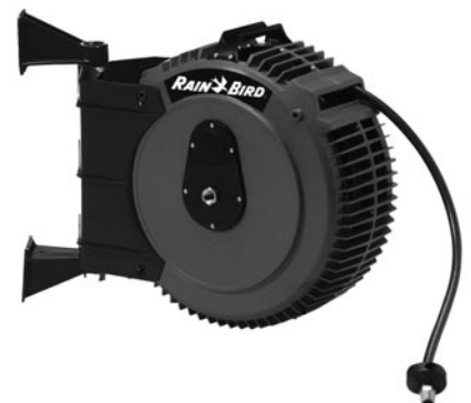
Rain Bird Poly Hose Reel