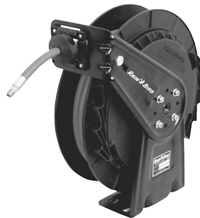
Composite Hose Reel

Composite Hose Reel —Hybrid design incorporates industrial grade steel with engineered composite components. Ideal for applications that are less demanding.