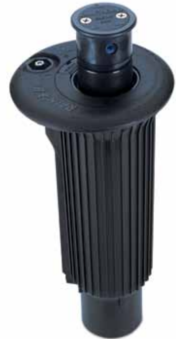
● EAGLE™ 900 Series