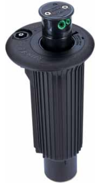
● EAGLE™ 950 Series