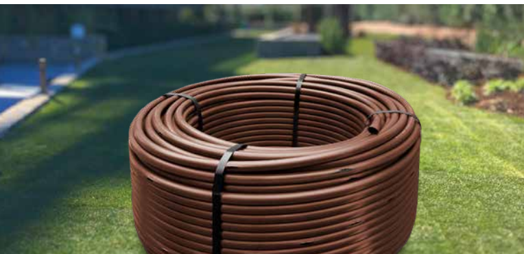
XFD Series Dripline

Trees, lawns, and immaculate greenery contribute to the resort's impressive tranquility. Maintaining a lush landscape while preserving the luxury aesthetic presents a constant challenge. Irrigation overspray onto exterior windows and mirrors would require additional cleaning and maintenance costs. Similarly, hundreds of sunbeds would need to be moved each morning and evening to accommodate watering schedules. At the same time, environmental stewardship and water conservation play an important role in the resort's public image.