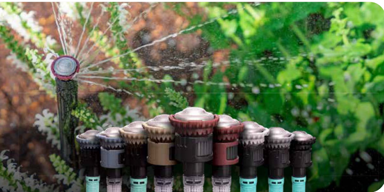
R-VAN Rotary Nozzles

Michael Galli's landscape plan includes distinct outdoor spaces for entertaining, gardening, hot tubbing, and more. To maximize the available topsoil and water, he will rely on two best-in-class solutions: Proven Winners® ColorChoice® plants and an intelligent Rain Bird® irrigation system. He will also use custom-made bottomless urns to create additional growing space.