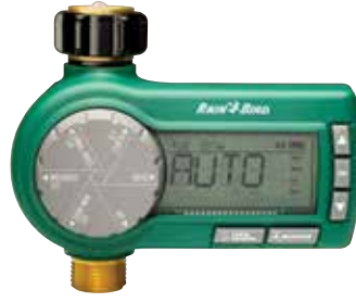
PREMIUM 1ZEHTMRP and 1ZEHTMRP-BSP