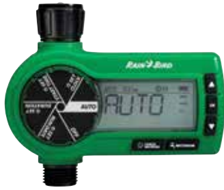
EASY TO PROGRAM 1ZEHTMR, 1ZETHTMR and 1ZETHTMR ESP