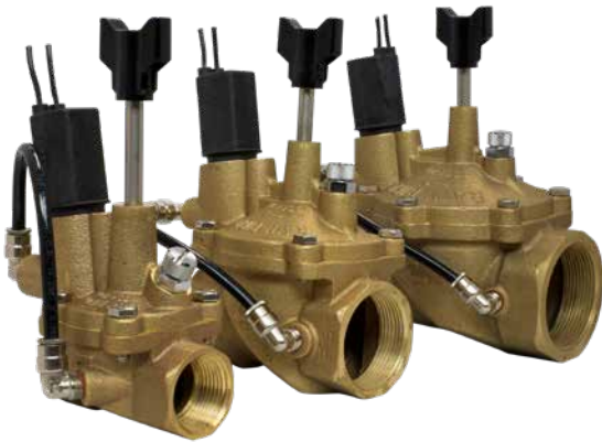
EFB-CP Series Valves

Electric remote control valves don't come any better than EFB-CP Series valves, which are reclaimed ready in order to handle the harsh conditions in non-potable water situations. Need a contamination-proof, self-flushing screen that cleans itself and resists debris build-up in dirty water? The EFB-CP's the one! Rain Bird brass valves offer long life and superior performance in high pressure applications.