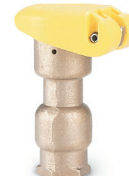
3-RC, 5-RC, 5-LRC