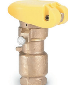
33-DRC, 33-DLRC, 44-RC, 44-LRC