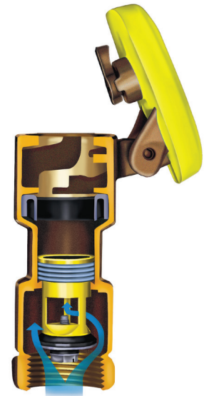
Quick-Coupling Valve Cutaway