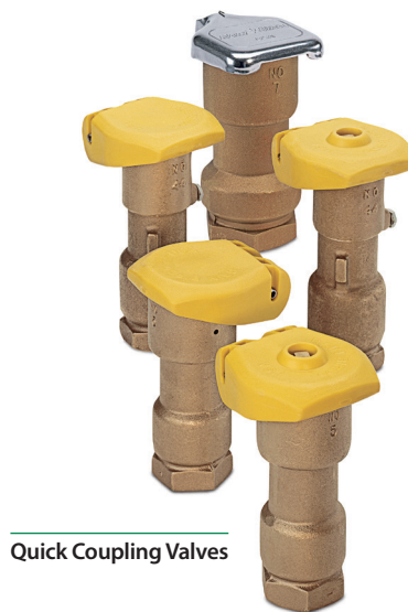
Quick Coupling Valves