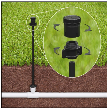
SQ Nozzle on PolyFlex Riser Assembly (PFR-FRA)