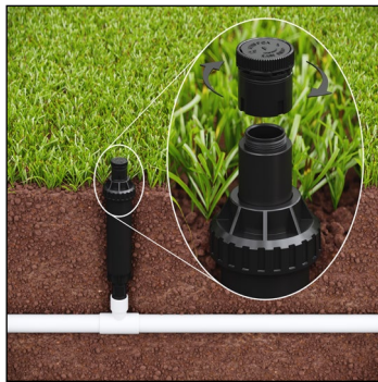
SQ Nozzle on 1800 Spray Body Assembly