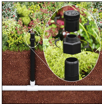
SQ Nozzle on Schedule 80 Riser Assembly