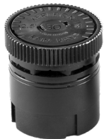
Model: 3QTR Three Quarter Wetting Pattern