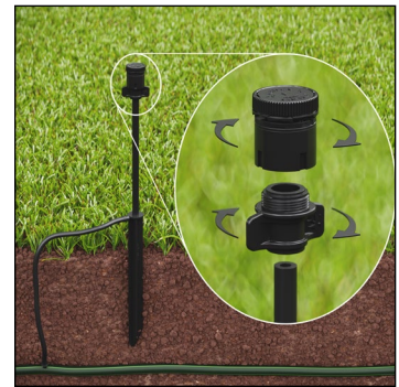
SQ Nozzle on Poly Flex Riser and Stake Assembly (PFR-RS)