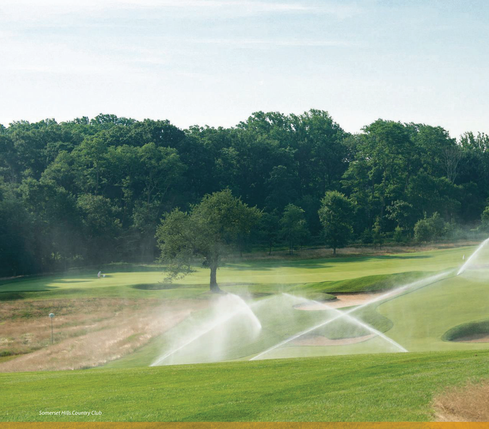
Somerset Hills Country Club