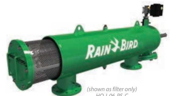
(shown as filter only) HO-I-06-PS-C