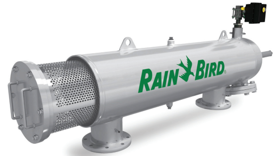
(shown as filter only) HT-I-06-PE-S

Note: I-Series filters integrated with a Rain Bird Pump Station utilize 110 VAC controls.