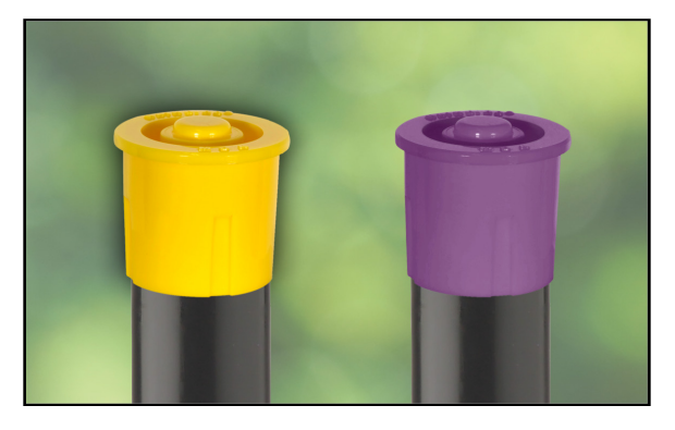
POTABLE YELLOW CAP